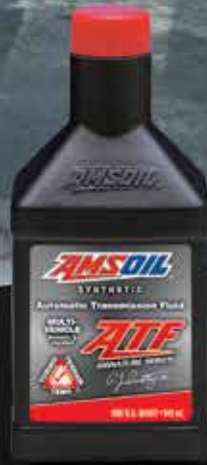
SYNTHETIC DRIVETRAIN FLUIDS