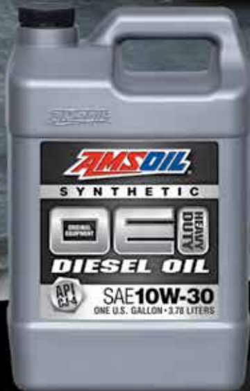
SYNTHETIC DIESEL OILS