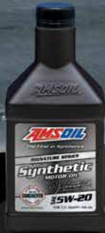
SYNTHETIC MOTOR OILS