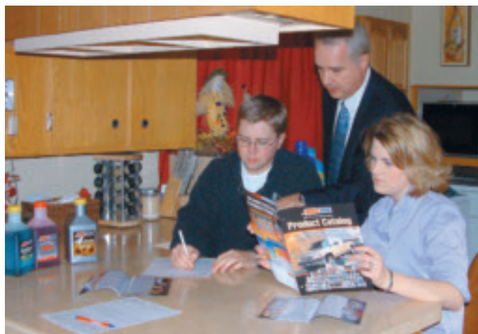
You can earn more by sponsoring other people as AMSOIL Dealers and helping them build their businesses as you build yours.